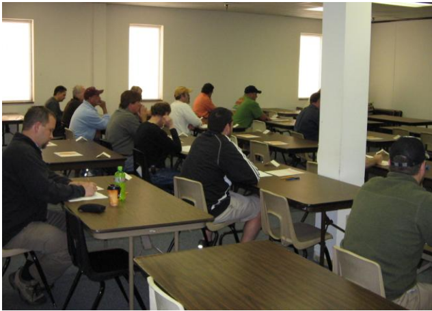
Another group of examinees prepares to take the state licensing exam at the Board office in Raleigh.